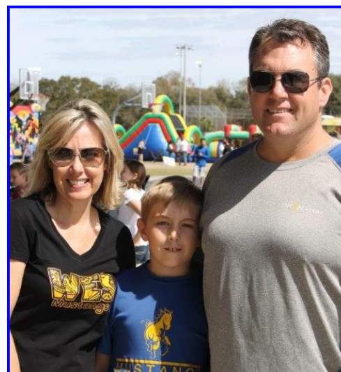
WES Spring Carnival

✓ WES will begin standardized testing this month, into the month of April. We ask that during this testing period you limit your time at school, in the lunchroom, and in the hallways. Due to testing, lunch schedules for your child may be altered.